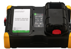
SST Dock SST-DOCK