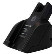
Universal Cradle Charger for SST Range SST-IND-S