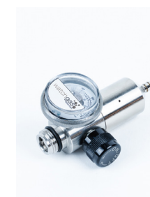
Fixed flow Regulator stainless Steel 715 0.5LPM PN: A0299024 Fixed flow Regulator 715 0.5LPM (Brass) PN: A0195339