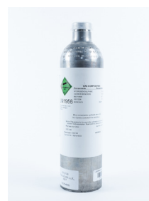
Gas cylinder Ask for availability