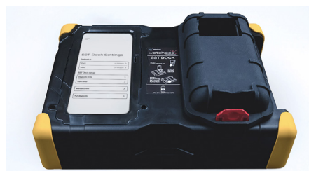
WatchGas SST Docking Station for SST1/SST4/SST4 Pumped Touch screen PN: SST-Dock