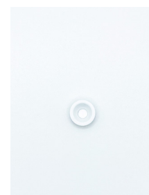
WatchGas SST1 External filters Pack of 10: SST1-XF-10 Pack of 100: SST1-XF-100